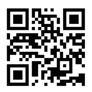
Scan to shop select items online, or stop by the winery to see the full collection.